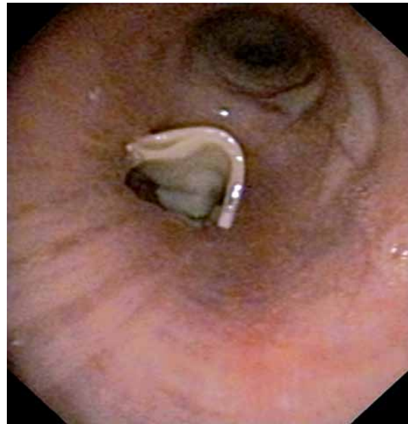
Photo 1. Proximal part with the falling petal valve of the rubber endobronchial prosthesis is seen, while its distal cylindrical part is implanted in the affected upper segment of the left lower lobe (patient 10)

Palmen et al. [8] showed that VAC treatment of recurrent empyema in the presence of the residual lung tissue with or without alveolopleural fistula achieved spontaneous OWT closure through the acceleration of tissue granulation. There was such